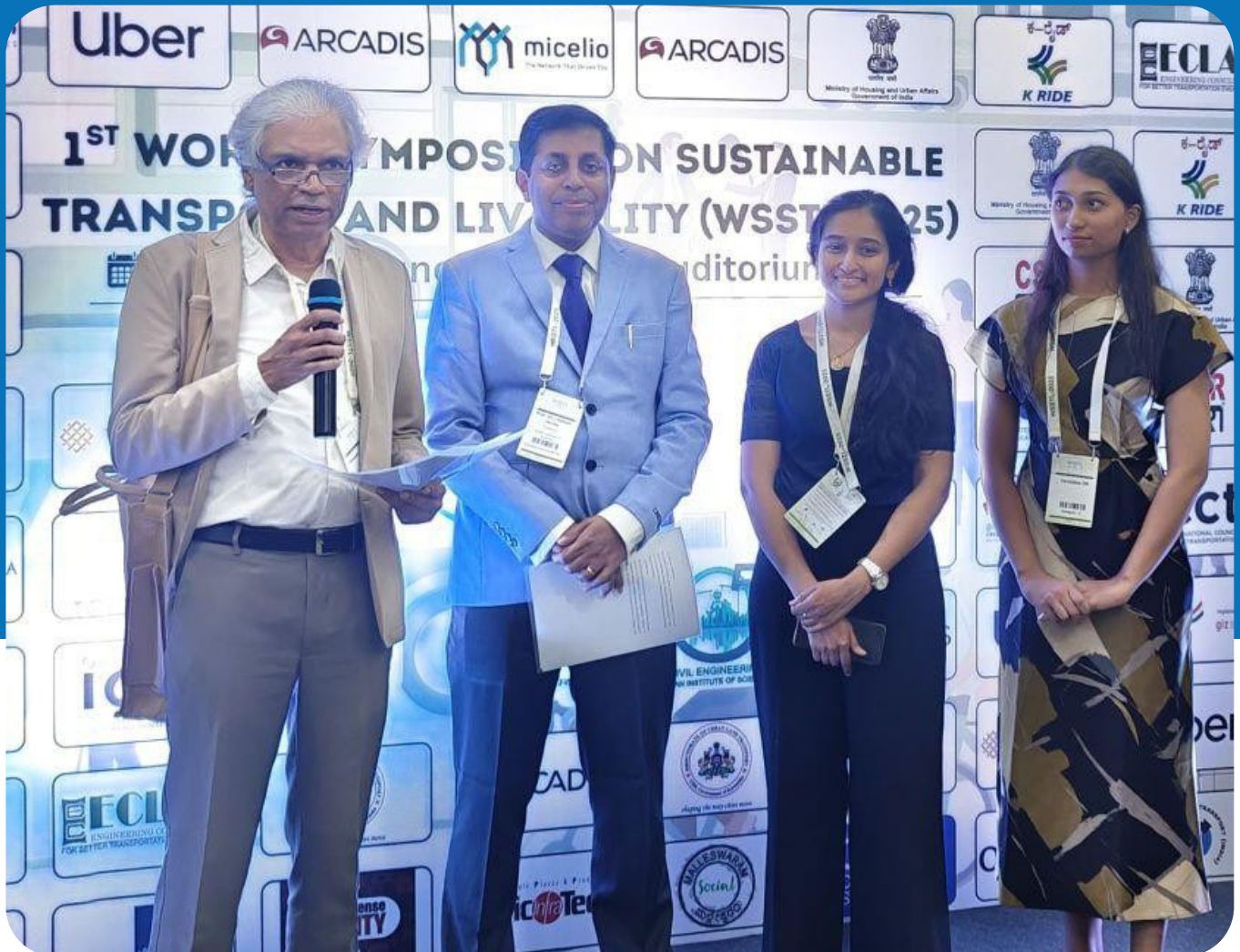
Poster presentation at IISc WSSTL 2025 Symposium

We were honoured to present the IRR (Intermediate Ring Road) project during the community engagement session of the World Symposium on Sustainable Transport & Livability (WSSTL), hosted by IISc on 24th June 2025.