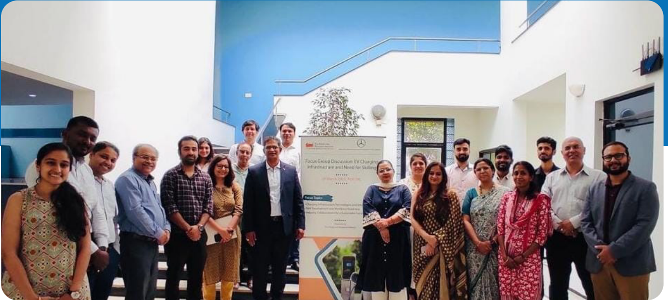
B.PAC in the Focus Group Discussion on 'EV Infrastructure and Need of Skilling' organised by TERI & Mercedes Benz Research & Development India