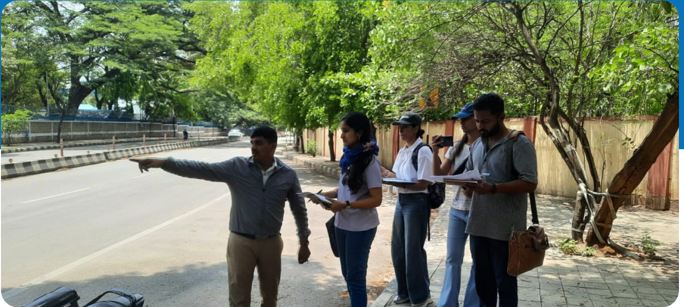
Roadcrash blackspots correction with Ulsoor & JB Nagar Traffic Police along with WRI India

The inspection, carried out alongside Ulsoor and JB Nagar traffic police officials, focused on identifying design flaws and proposing safety improvements. This initiative is part of our continued commitment to making Bengaluru's roads safer for all.