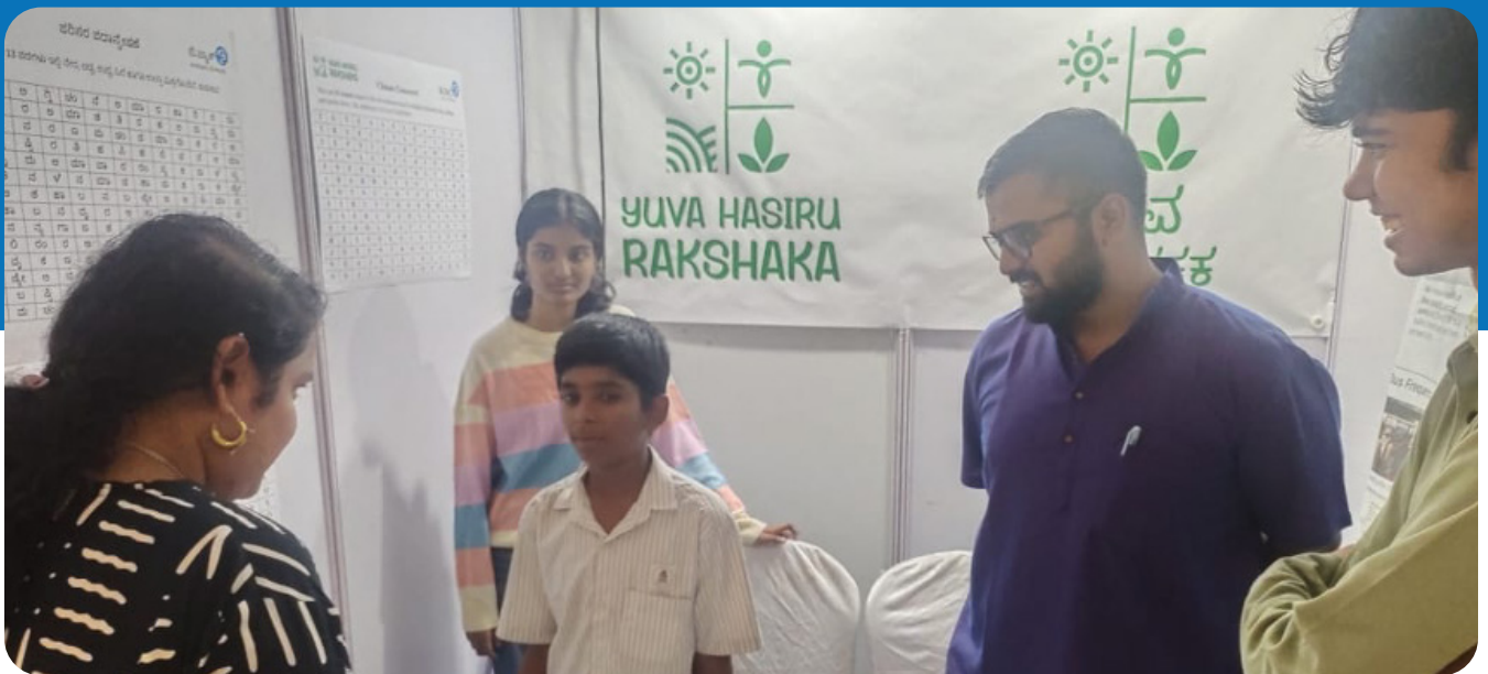
Student from the pilot project of YHR presenting about the program at the BluGreen Awards & Showcase

At the BluGreen Showcase on June 6th, held in celebration of World Environment Day at Jawaharlal Nehru Planetarium, we exhibited its flagship projects Yuva Hasiru Rakshaka and IRR Street: Standstill to Active.