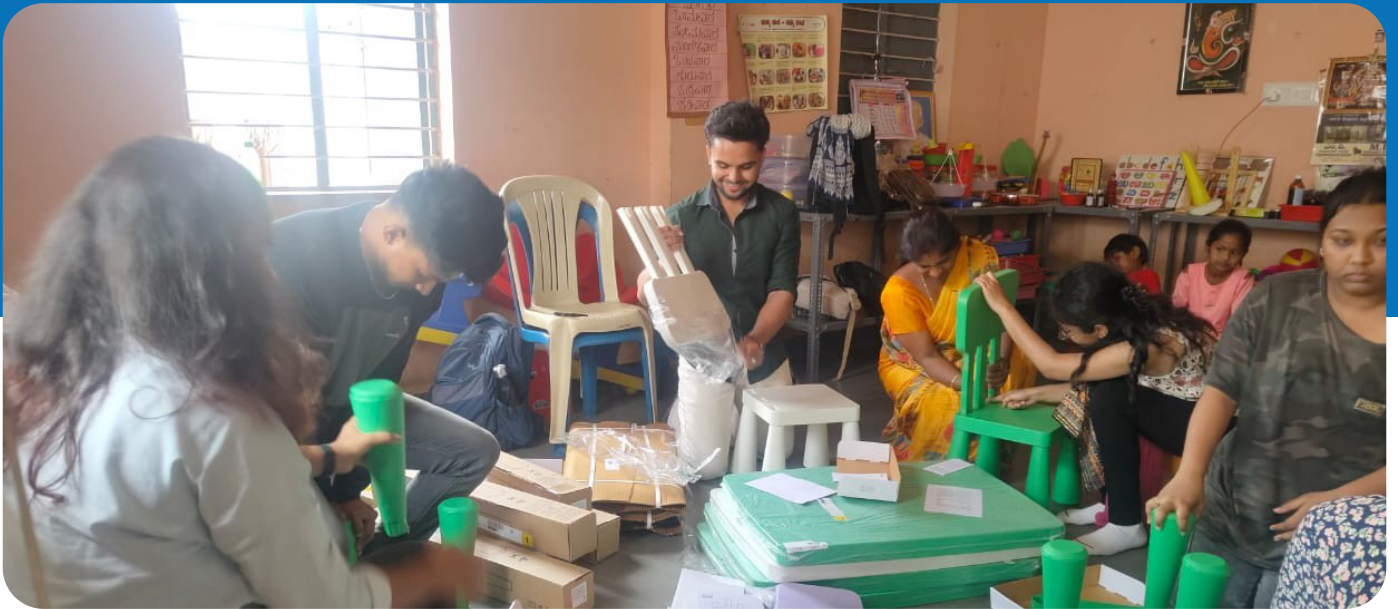
TTIBI volunteers assemble the furniture at the Anganwadi kendra of Dasarahalli

Under the B.SAFE initiative in collaboration with TTIBI, two Anganwadi centres at the Chinnara Goodu TTIBI Anganwadi Kendra were upgraded with brand-new furniture. This intervention is part of our ongoing efforts to create safe, nurturing, and well-equipped environments for young children, ensuring that early learning spaces are both functional and welcoming.