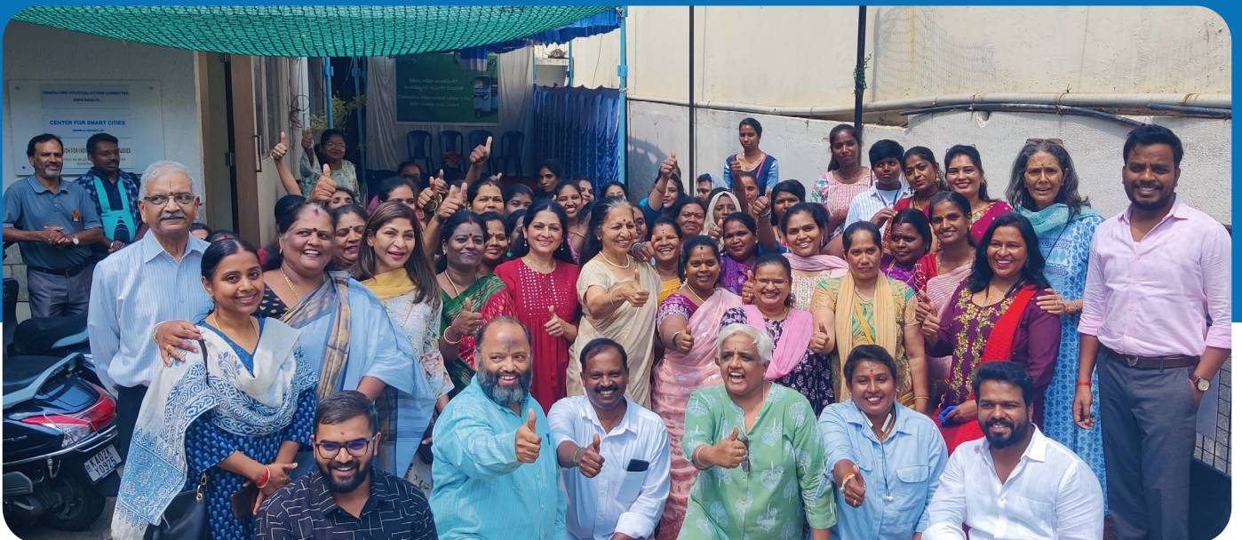
May day celebration at B.PAC with the Women of B.SAFE's Women Auto drivers training program