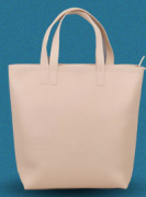
Bring Your Own Bag