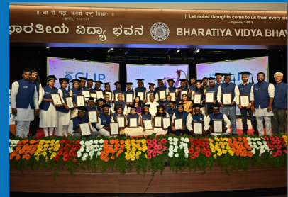
B.CLIP Batch 8

We look forward to their contributions in shaping a better Bengaluru.