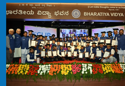
B.CLIP Batch 7