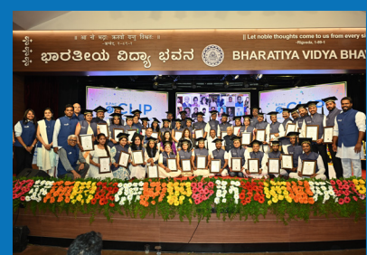
B.CLIP Batch 6