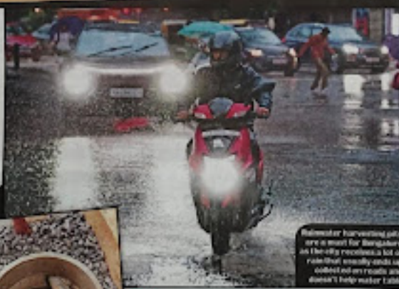
Rainwater harvesting pits are a must for Bangalore as benefits received a lot of rain that mostly ends up collected on roads and doesn't help make tables

T he Bruhat Bangalore Mahanagara Palike (BBMP) has allocated Rs 2.58 crore towards digging 250 percolation pits at different locations in the city to harvest rainwater. Many citizens, especially environmentalists, approached the BBMP's decision to harvest rainwater but some of them are not happy with the cost involved for each of the percolation pits. The BBMP is set to spend Rs 1 lakh per each of the percolation pits. They question the BBMP's due diligence in calculating the cost (Rs 1 lakh) for each percolation pit while the actual cost to dig a percolation pit does not go over Rs 50,000. They said that percolation pits have been dug up at some of the residential layouts in Bangalore East. For example, the residents of Nagarajana Layout engaged a private