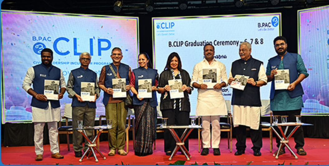
B.CLIP Batch 6