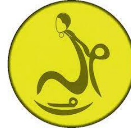
Karnataka State Commission for Women https://kscw.karnataka.gov.in/