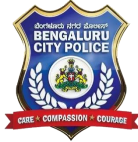
Bengaluru City Police https://bcp.karnataka.gov.in/