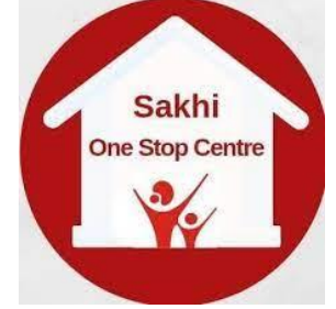
Saksi One Stop Center https://wcd.karnataka.gov.in/