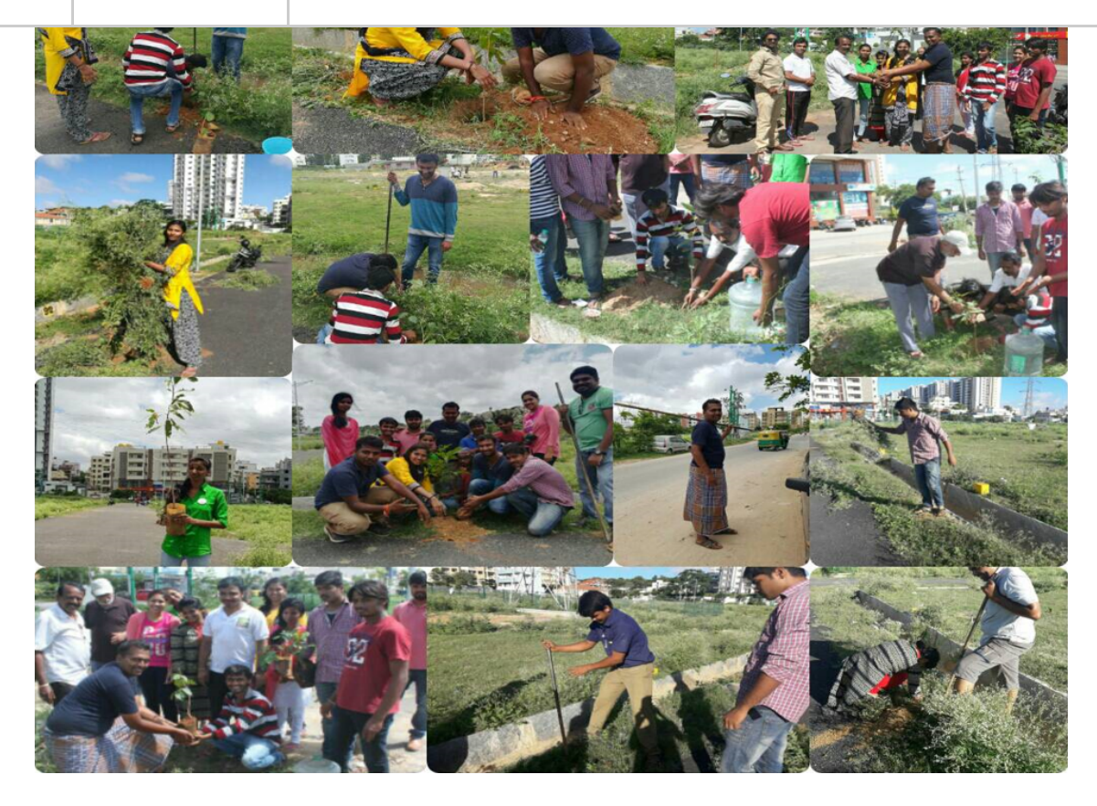
Composting Santhe at Basavanagudi