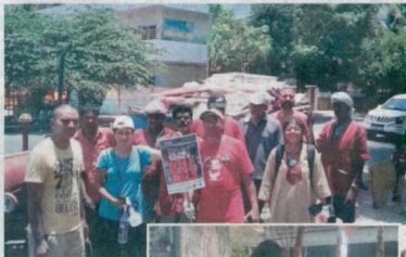
HSR Layout residents during their mission of removing posters and bills.

She continued, "In the span of one month we have conducted four drives. After identifying offending areas, we have removed a number of bills and posters during weekends. In fact people from areas like Jayanagar and Infantry Road