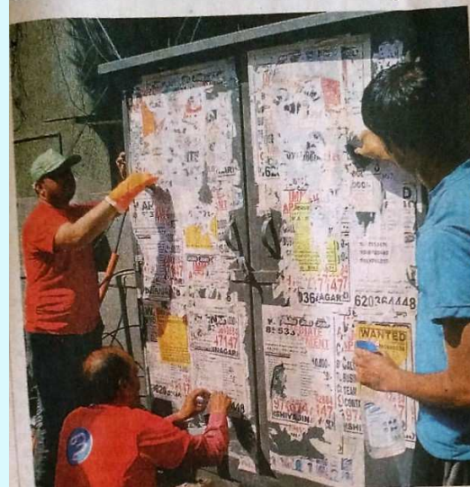
Volunteers tear bills pasted on public walls and utilities on Cunningham Road in Bengaluru on Sunday