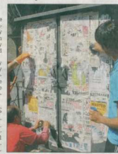
FOR BETTER VIEW: Activists remove ads, posters

Armed with scrapers, cutters, knives, hammers and water sprays, volunteers of B.PAC Civic Hub, along with groups of locals and activists, started as early as 6 am in the morning. Accompanied by locals and interested individuals, they went about pulling down illegal posters and bills in Sanjaynagar, Basahakrishna, HSR Layout, Sampangirammagar, Prashanthnagar, Gayathrinagar, Jayanagar, Indi-