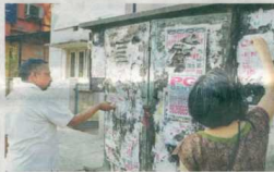
B PAC volunteers remove posters at HSR Layout on Sunday.

"Illegal posters have tarnished the beauty of the city and we aim to put an end to this. It is a long process but we would like to take one step at a time,"