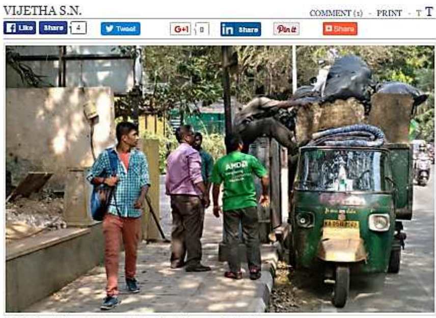
Activists found evidence that the waste had originated from a particular building.

Bangalore Political Action Committee and the Active Residents Welfare Association caught staff of a commercial building on Infantry Road illegally dumping garbage on the streets.