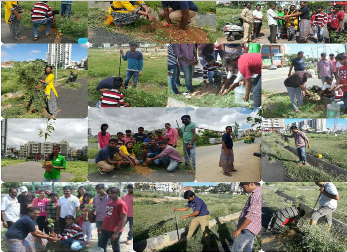
Composting Santhe at Basavanagudi