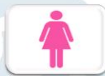
Women Safety Measures